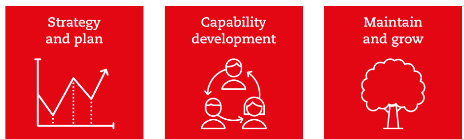
FIGURE 5: Components of implementation roadmap

Cyber risk management. Cyber security is an absolute priority for accountancy firms, none of which would have made the journey had their concerns not been adequately addressed. It is a risk that cannot be ignored, however just because the software and data is resident in the cloud.