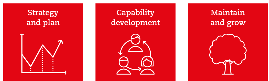
FIGURE ES1: Tangible steps for public sector finance and accountancy professionals

Above all, however, the message from those interviewed is that they enjoy this work. They have a passion for their business and their clients’ businesses.