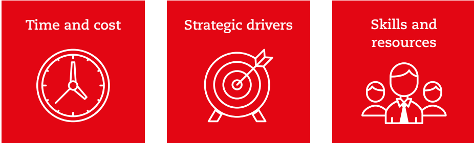
FIGURE 4: Benefits of digitalisation