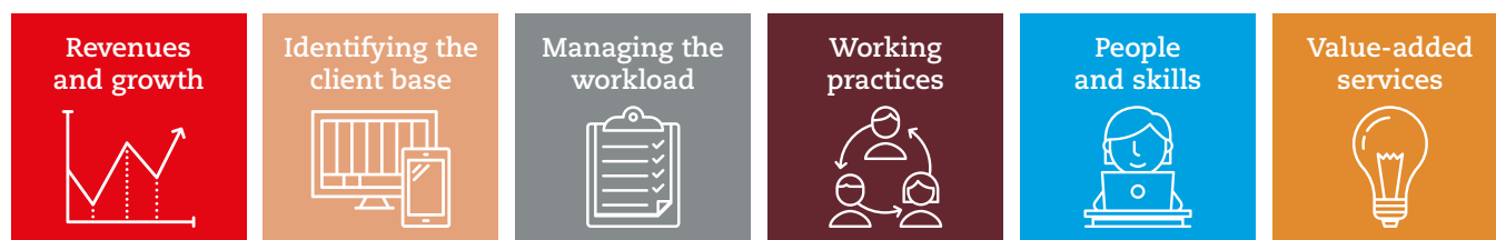
FIGURE 2: Impact of digitalisation

'We use pretty much every single pricing methodology to get to the outcome', he says. 'We use [an] hourly rate, value pricing, performance-pricing fixed-fee stuff, depending on the nature of the actual work. So, if it's a big job, we will actually use a combination of all of those things'.