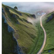
S1 and S2 explainer videos →

VISIT THE ACCA SUSTAINABILITY PACK 2023 HERE →