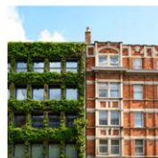
Insights reports →

Watch ISBB members explain the recently published corporate standards on sustainability disclosures for 1 unit of free CPD