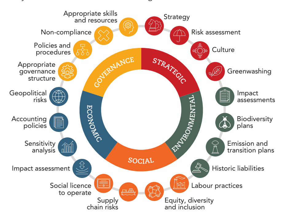
FIGURE 3: Sustainability-related considerations in due diligence

The output of the due diligence process should be evaluated against the risks and opportunities of the transaction. All transactions are undertaken to enhance or create value. Sustainability-related considerations do not only present risks, but they can also present opportunities. Those who evaluate the transaction must ensure that they have access to appropriate skills such that they can make an informed decision.