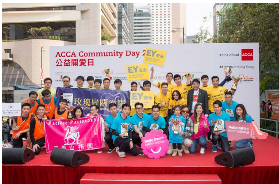
▲ Winning teams showing their triumph at the prize presentation ceremony