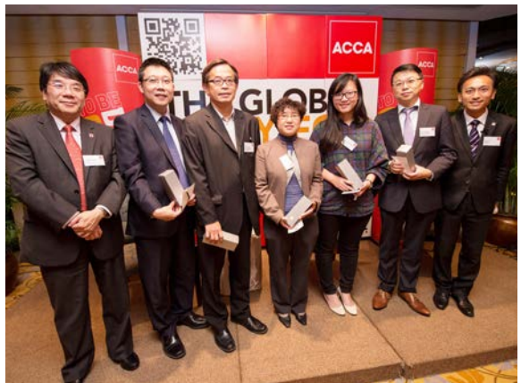
▼ Both mentors and mentees enjoying the ice breaking game and winning prizes from the game