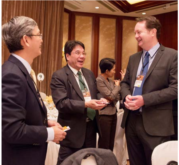
▲ Sharing laughters during networking lunch ▼ Photo for memories after a successful Summit

We are delighted to receive very positive feedback from the speakers and fellow attendees of the CFO Summit. With an online application 'Pigeonhole', which facilitated live polling and Q&A via mobile devices as the conference progressed, we also received active participations and high level of engagements from the delegates.