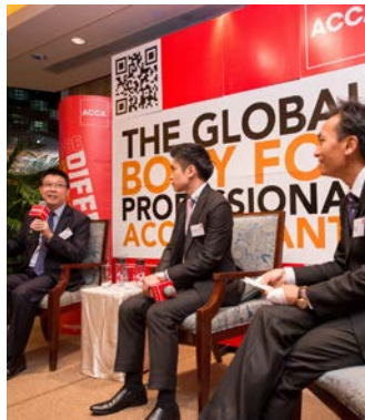
▲ Mentors and mentees pictured at the launching event