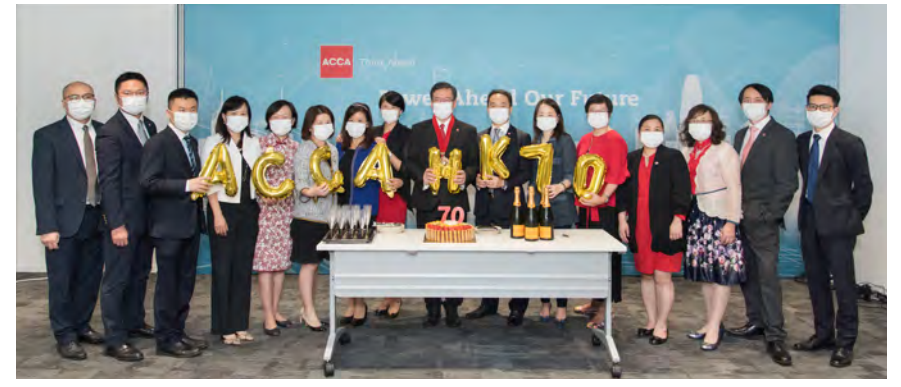
Celebrating ACCA's 70th anniversary in Hong Kong together with our Committee and Council members