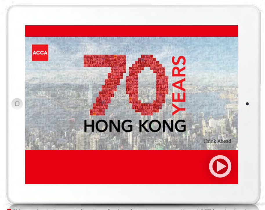
This mosaic art piece symbolises the collective efforts of many generations of ACCA professionals over the past seven decades and the power of the ACCA community that drives us forward

The year 2020 marked the 70th anniversary of ACCA's presence in Hong Kong. To celebrate this important milestone amid the Covid-19 outbreak, ACCA Hong Kong hosted a series of celebratory activities online.