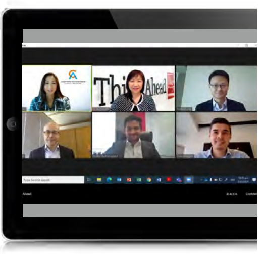
have participation from an exceptional line-up of speakers for insightful discussions.

The webinar was kicked off by a presentation of an ACCA Professional Insights report titled <u>The CFO of the Future</u>. We're also pleased to