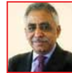
Muhammad Zubair Minister of State for Privatization (tbc)