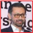
Naem Zamindar Minister of State & Chairman, Board of Investment