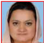
Maryam Aurangzeb Minister of State for Information and Broadcasting