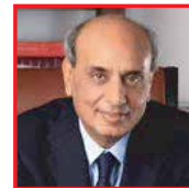
Mian M. Mansha