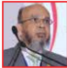
Riaz Riazuddin Deputy Governor, State Bank of Pakistan