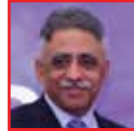
Muhammad Zubair Governor Sindh