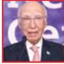
Sartaj Aziz Deputy Chairman Planning Commission