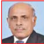
Muhammad Rafique Rajwana Governor of Punjab