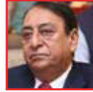
Rana Muhammad Afzal Khan Minister of State for Finance and Economic Affairs