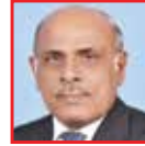
Muhammad Rafique Rajwana Governor of Punjab