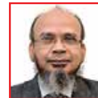
Riaz Riazuddin Deputy Governor, State Bank of Pakistan