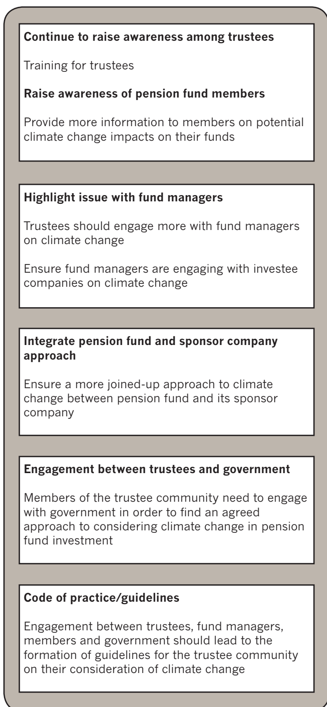
Figure 4.2: Recommendations for improving the consideration of climate change in pension fund investment

We appoint managers every once in a while...the time to take a stand on environmental or socially responsible investment is when we're appointing managers...I don't know at what point we'd decide this, or we're going to pull out of what we're in and appoint new managers, on the basis of SRI or environmental factors...if we got to the point where we were appointing new ones it's certainly something that we'd raise then and I'd be keen on it[s] being more than just a tick box question. (T2, emphasis added)